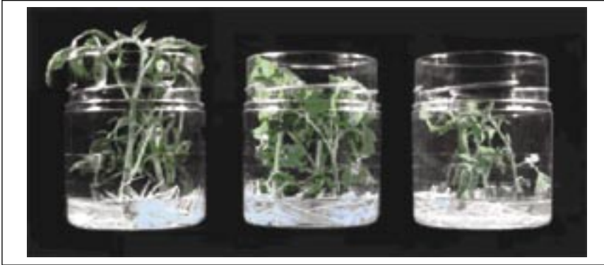
Figure 1. Tomato plantlets cultured (left) photoautotrophically under high PPF, vessel ventilation rate and CO 2 concentration without explant (nodal cuttings) leaf removal, and photomixotrophically under low PPF, vessel ventilation rate and CO 2 concentration with (right, the conventional method) and without (center) explant leaf removal.