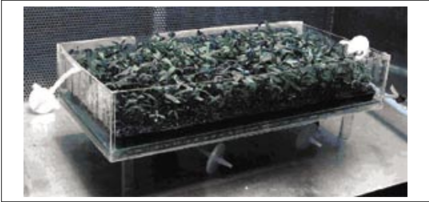
Figure 2. Scaled-up photoautotrophic culture vessel (picture taken after removal of the lid). The vessel was 610 mm long, 310 mm wide, and 105 mm high (volume approx. 20 liters) (for descriptions refer to Zobayed et al., 2000). The CO 2 -enriched air is pumped into the vessel through the inlets into the air distribution chamber beneath the plug tray. A nutrient solution in the reservoir (not shown in the picture) is sent to the root zone to soak the vermiculite-based supporting material in the plug tray and returned to the reservoir as scheduled with a timer.