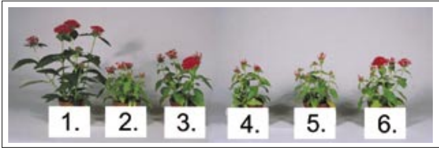
Figure 1. Plants from the different treatments (see Table 1) at start of flowering (still organic).